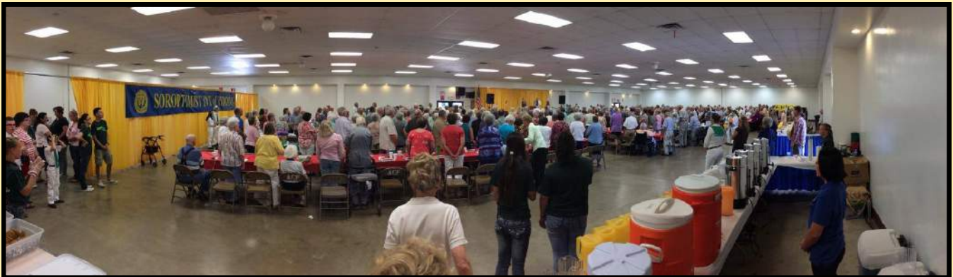
SIR Held it's 60th annual Pioneer Luncheon at the Anderson Fairgrounds on June 6th. Pioneers living in Shasta County for at least 50 years and being at least 65 years of age were honored by Soroptimists with lunch and entertainment as well as prizes for attendees.